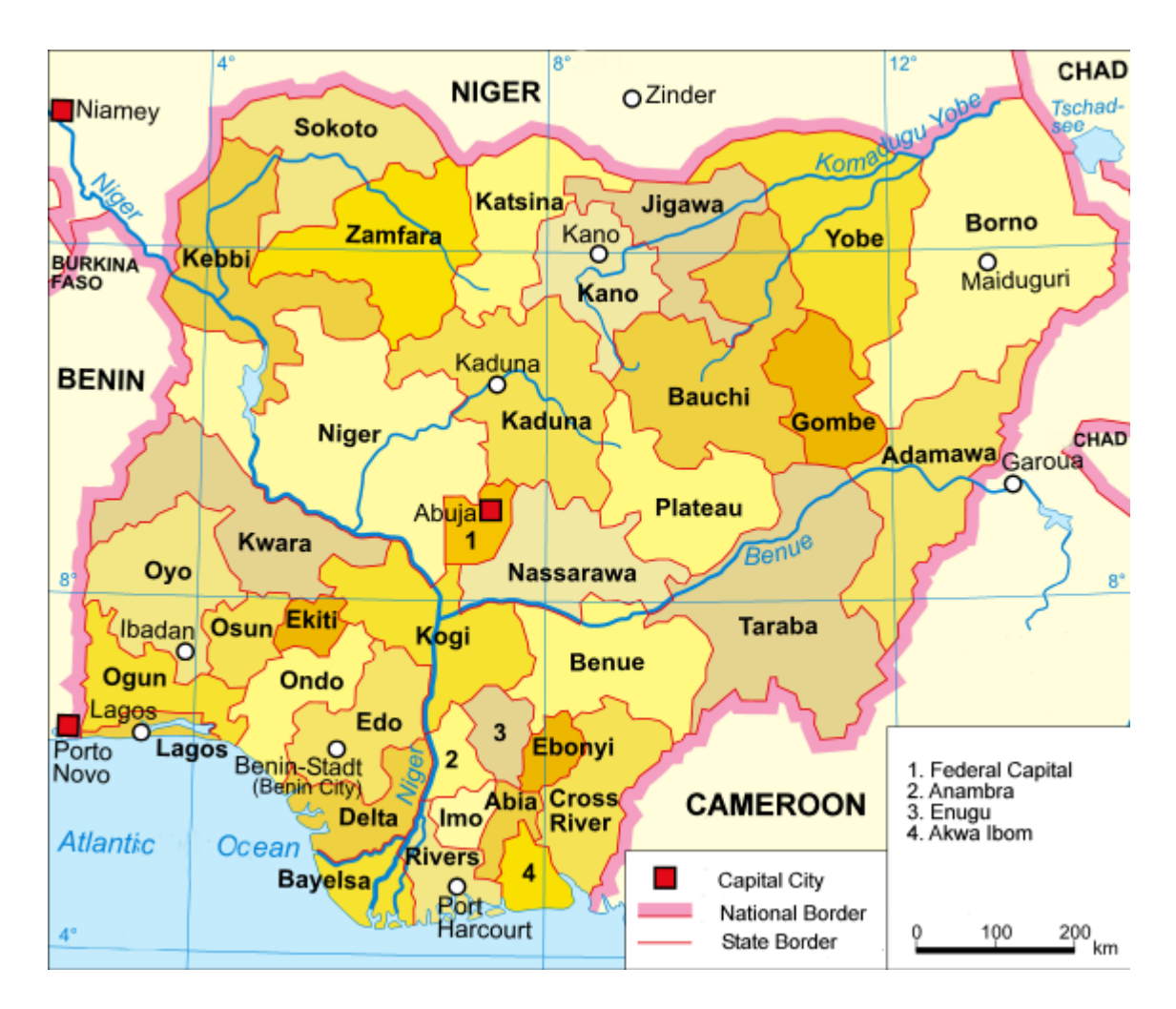
Fig. 3.1: Geographical map of Nigeria